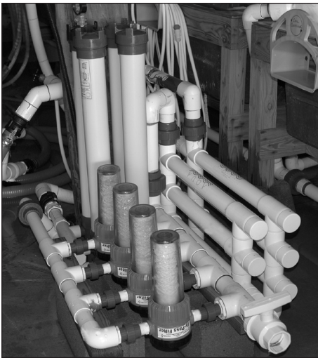
Figure 3. Small cartridge and ultraviolet sterilizer filter system for treating seawater.