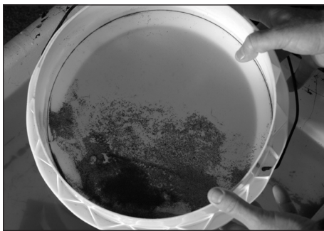
Figure 9. Sieving oyster larvae.

Most fertilized eggs develop into trochophore larvae within 12 to 20 hours. These become veliger larvae (also called straight-hinge or D-shaped larvae) within 20 to 48 hours. The first draining and sieving (Fig. 9) is done at about 48 hours. Water is drained slowly through the appropriate size sieve (Table 1) and the retained larvae are placed in a known volume of treated seawater (e.g., 10 L). Several 1-ml samples are taken, the larvae are counted in a Sedgewick-Rafter cell, and the average number is used to calculate the total number of larvae, as in the egg count. Larvae are restocked in a cleaned and disinfected tank filled with treated seawater at the recommended density, five per ml or about 20,000 per gallon. This process is repeated every 2 days (daily as larvae near setting) with appropriate reductions in larval density (Table 1) until larvae are ready to set.