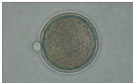
Figure 8. Fertilized egg with first polar body.

When oysters begin releasing gametes, the whitish sperm and eggs can be easily seen against the black background of the tank. Males release a near constant stream of sperm and females release eggs during periodic shell closures. As oysters begin to spawn, males and females should be placed in separate containers (1 gallon or 2.2 L) containing treated sea water to prevent uncontrolled fertilization. When females appear to have finished spawning, they should be removed from the containers and the containers aerated. Within 45 minutes of spawning all the eggs can be sieved on a 50-µm screen to remove debris. Eggs are then combined in one or several aerated containers and fertilized with a small volume of sperm (20 to 50 ml) combined from three or more males. After 15 to 20 minutes, eggs should be examined under a microscope to confirm fertilization. If no more than 10 percent of the eggs have a polar body (Fig. 8), more sperm should be added. When eggs appear adequately