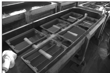
Figure 10. Upweller/downweller.

The bottom mesh on the upwellers should be cleaned daily. As the spat grow they are graded on different mesh size sieves and the larger spat moved to upwellers with larger mesh bottom screens to enhance water flow and growth. Growth is highly dependent on the density of spat, water flow, and the abundance of natural food in the water supply. Food can be supplemented with algae as in larval feeding.