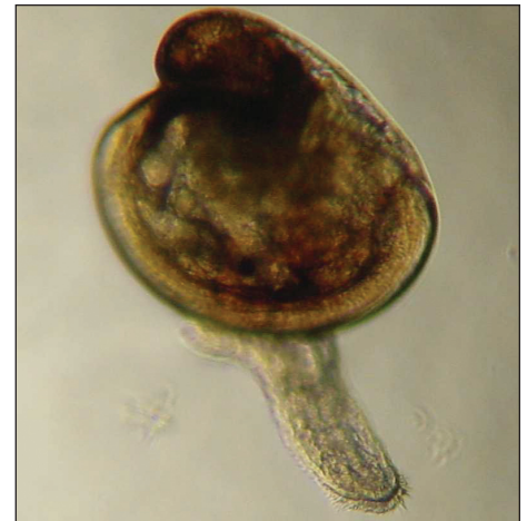
Figure 7. Pediveliger larva.

spot. Once settled, they attach and transform into small oysters called spat. Spat soon begin feeding on algae by filtering water through their gills and a special structure (labial palps) located just in front of the mouth.