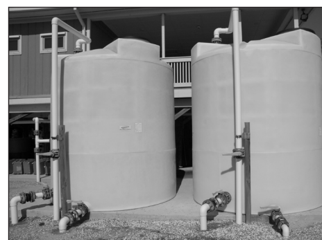
Figure 1. Large holding tanks for settling and water reserves.

The plumbing is designed with a water filtration and treatment system consisting of some combination of rapid sand filters, cartridge filters, activated