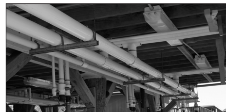
Figure 2. Overhead water and air lines.

carbon, ultraviolet (UV) sterilization or pasteurization (Fig. 3). Treated seawater is then suitable for larval and algal production.