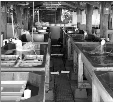
Figure 4. In-floor water drains and nursery tanks.

Shallow rectangular tanks with drain pipes provide nursery space for juvenile oysters. Aeration throughout the hatchery is supplied by an appropriate size blower, overhead PVC piping, vinyl tubing, and good quality air stones.