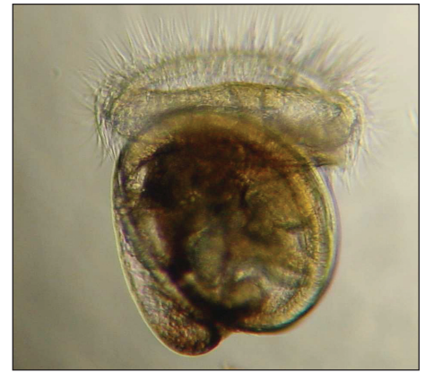
Figure 6. Veliger larva.